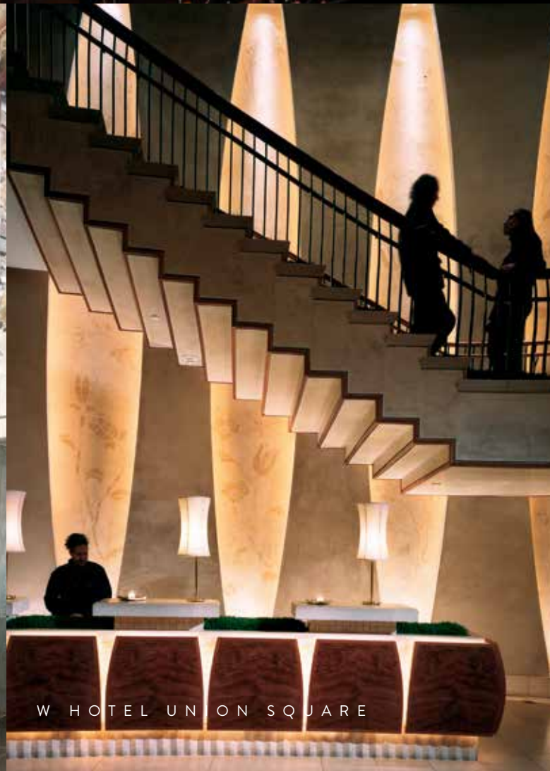
W HOTEL UNION SQUARE